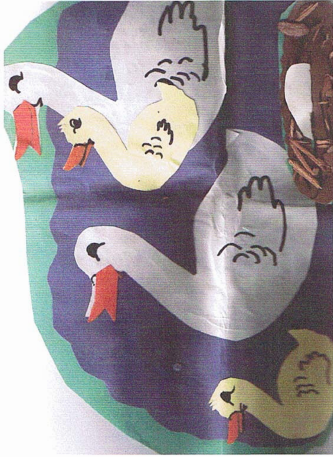
Duck craft idea: Green paper background, blue water, white mother ducks, yellow baby ducks, orange paper bills, Brown paper nest with hay or straw with a white egg.