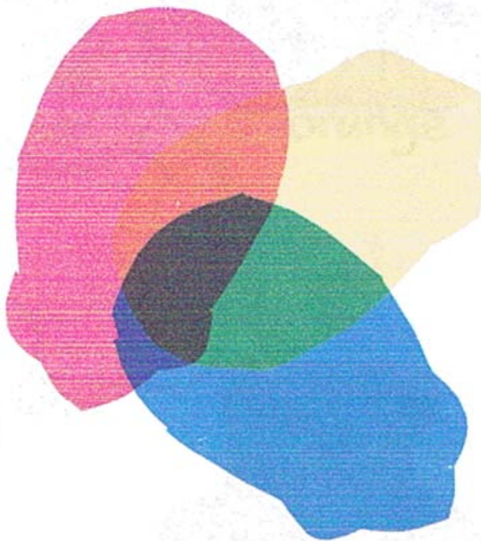
Mouse Paint by Ellen Stroll Walsh

Use red, yellow and blue cellophane wrap and cut it out in a mouse shape. The kids love to make new colors.